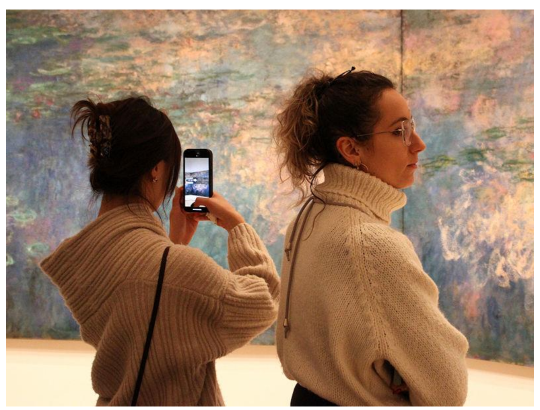
Visitors admire Claude Monet's Water Lilies