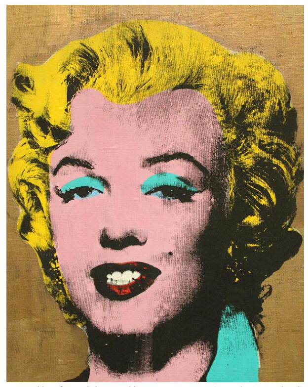
Detail of Gold Marilyn Monroe (Andy Warhol)