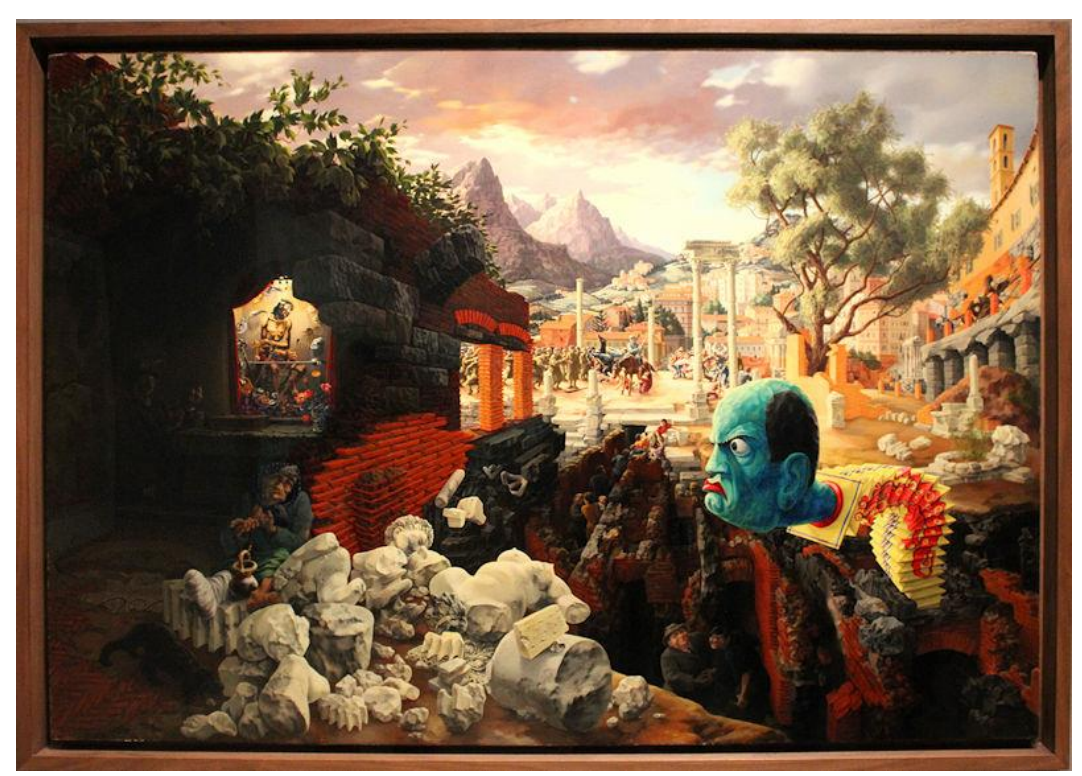
The Eternal City (Peter Blume)