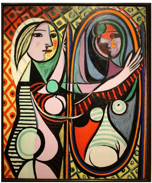
Girl before a Mirror (Pablo Picasso)