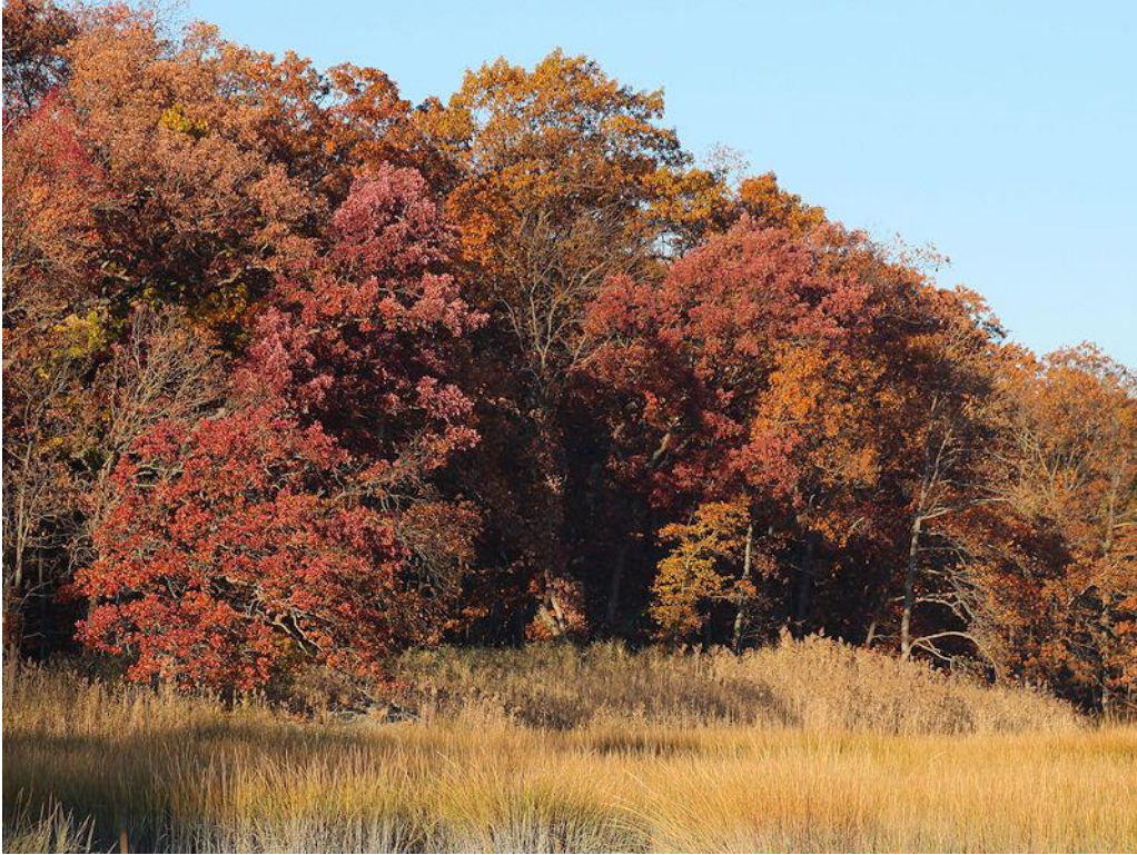
Marshlands Conservancy (Rye, NY)