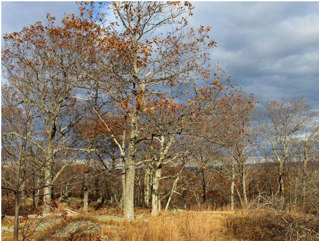
Turkey Mountain Nature Preserve (Yorktown Heights, NY)

Southeastern New York State saw colder air overspread the region. Saturday and Sunday were fine fall days, with highs in the lower and middle 50s and Saturday and chillier mid-40s on Sunday. Some fall scenes are below.