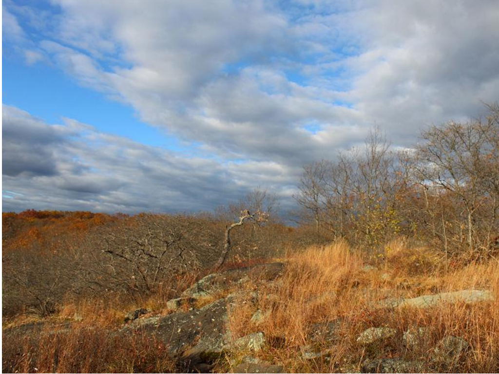
Turkey Mountain Nature Preserve (Yorktown Heights, NY)