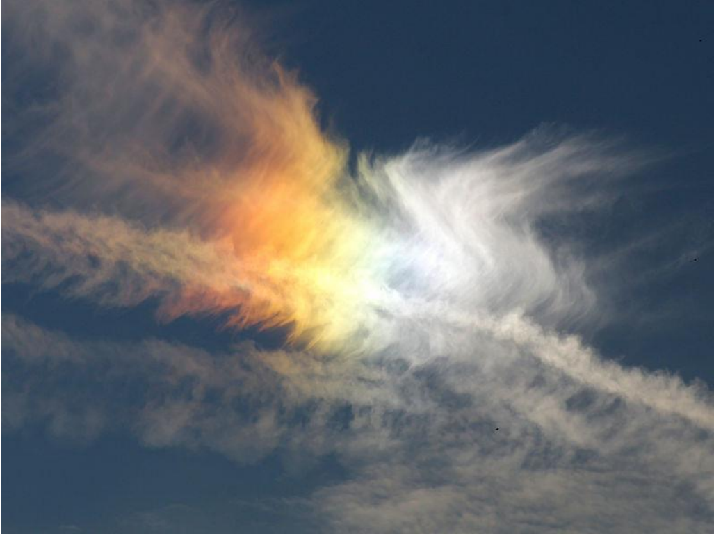
Rainbow cloud viewed from the Marshlands Conservancy (Rye, NY)