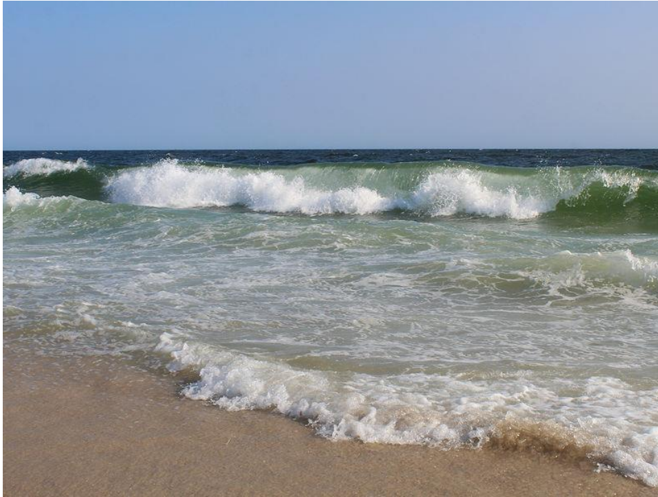
Robert Moses State Park

Last weekend was filled with sunshine. Afternoons were warm. Ocean temperatures were abnormally mild. It was great beach weather.