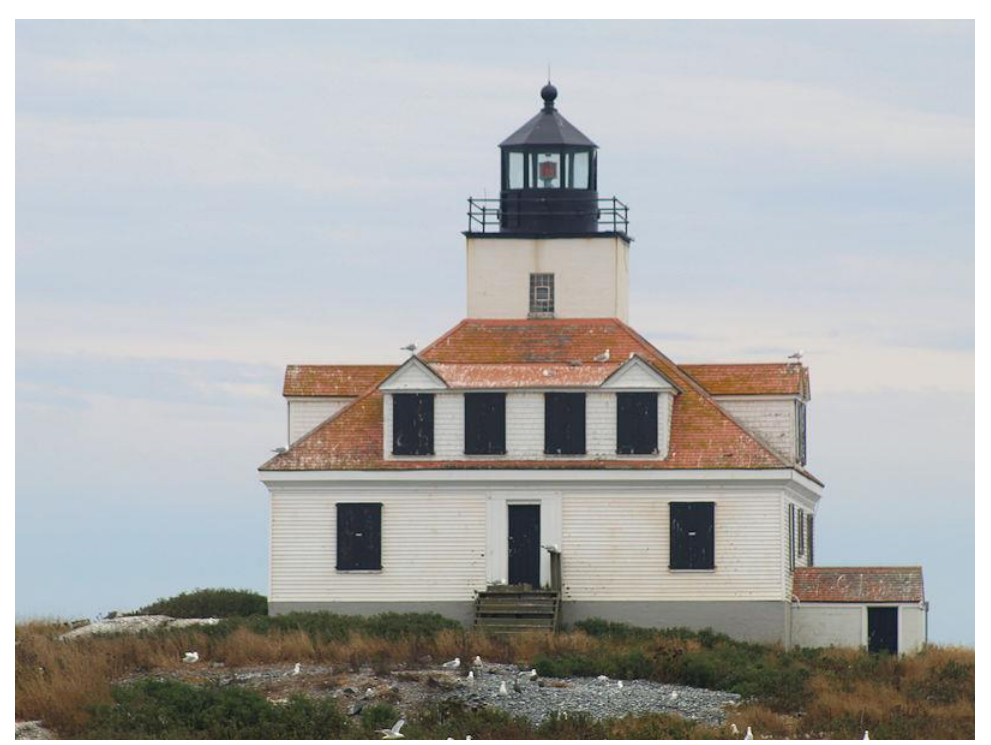
Egg Rock Lighthouse (Bar Harbor, Maine)