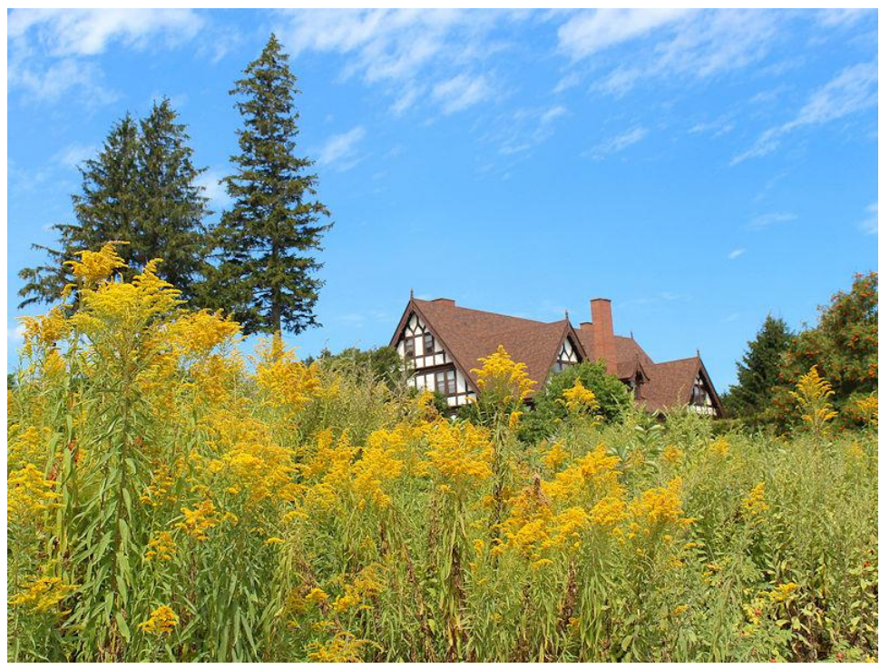
Bar Harbor, Maine