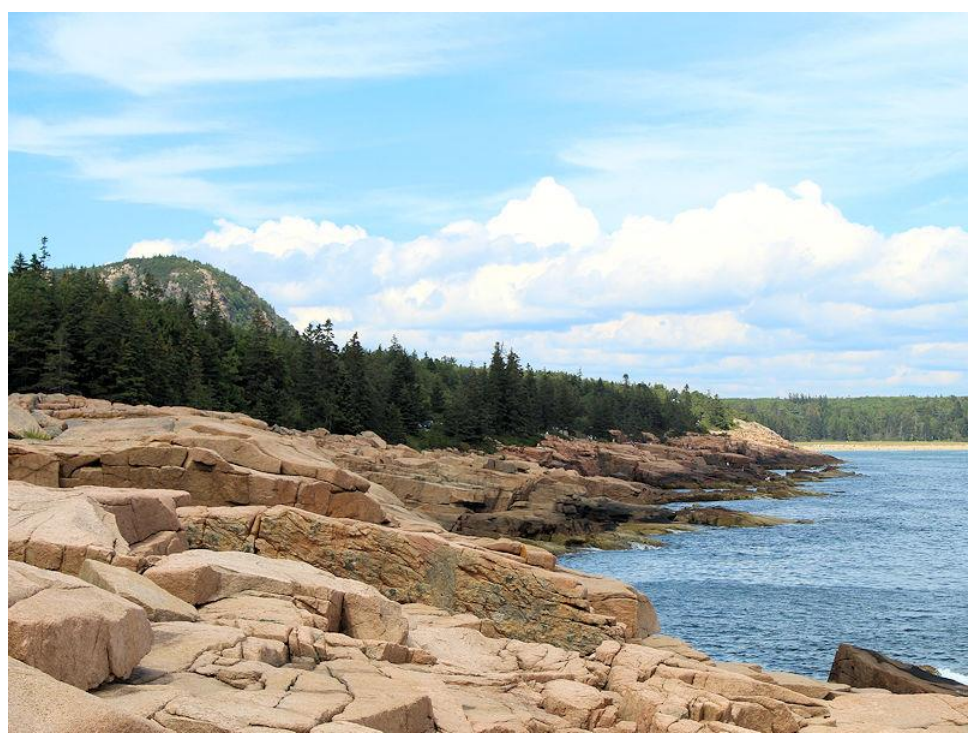
Acadia National Park

Finally, some photos from my trip follow.