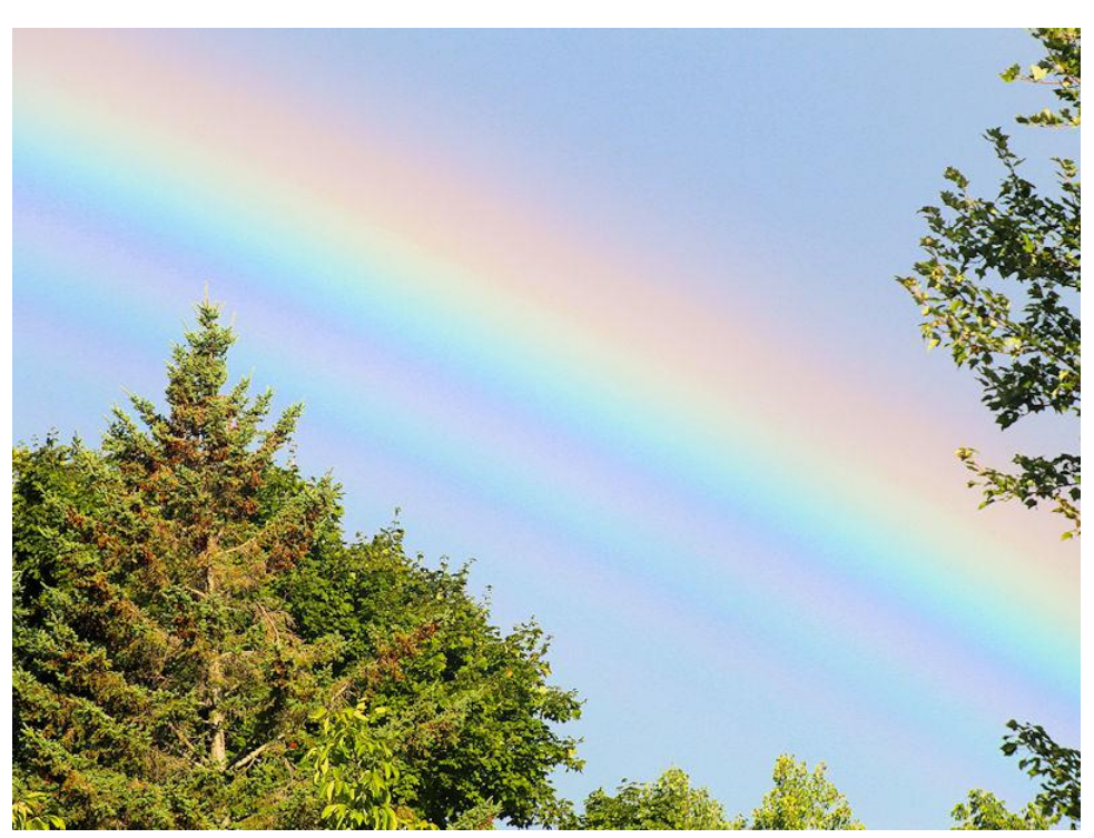
Rainbow (Stetson, Maine)