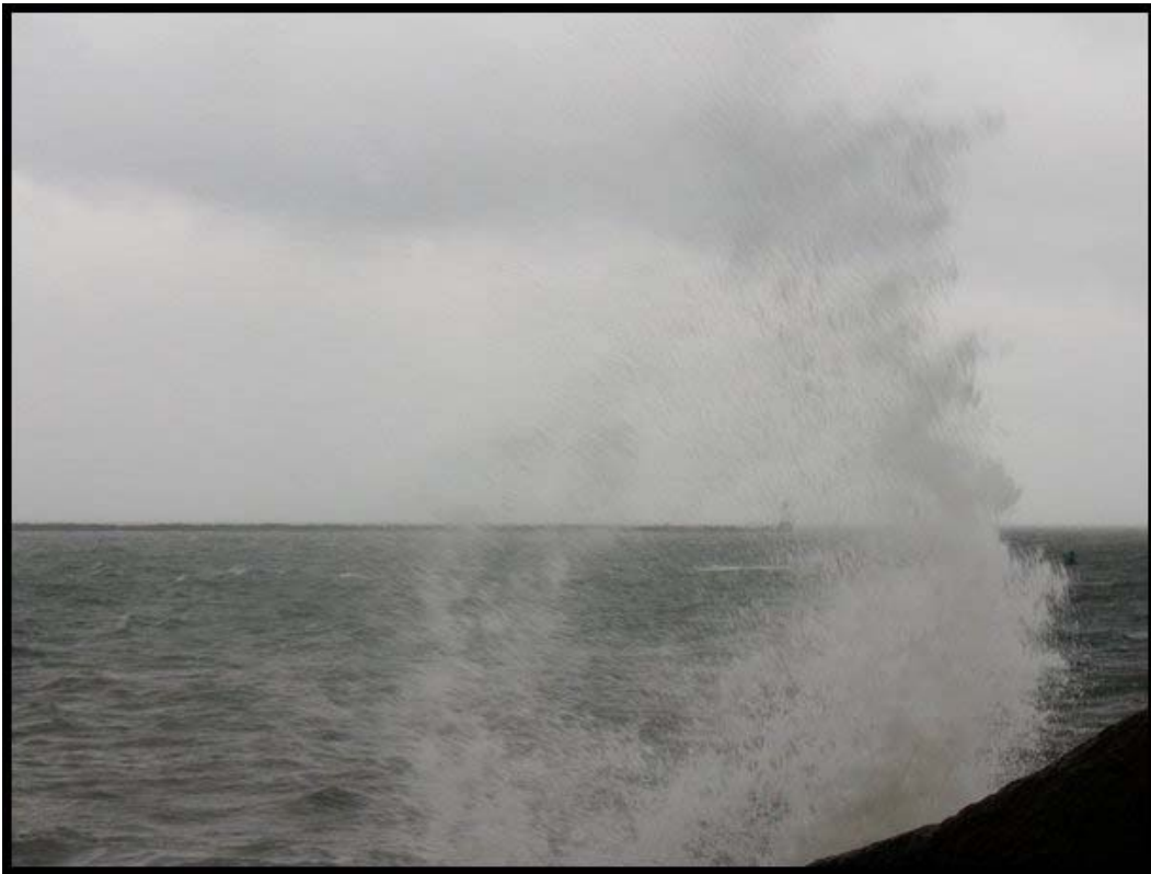
Spray from a fierce storm on October 29