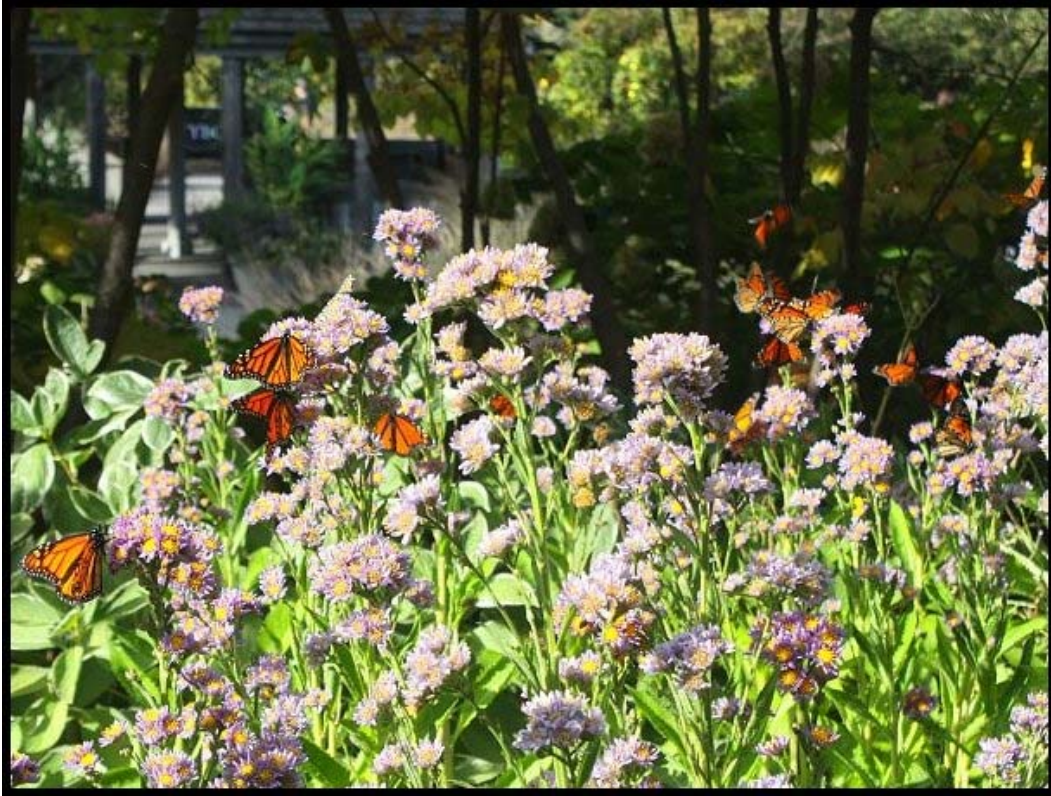
Migrating Monarch butterflies