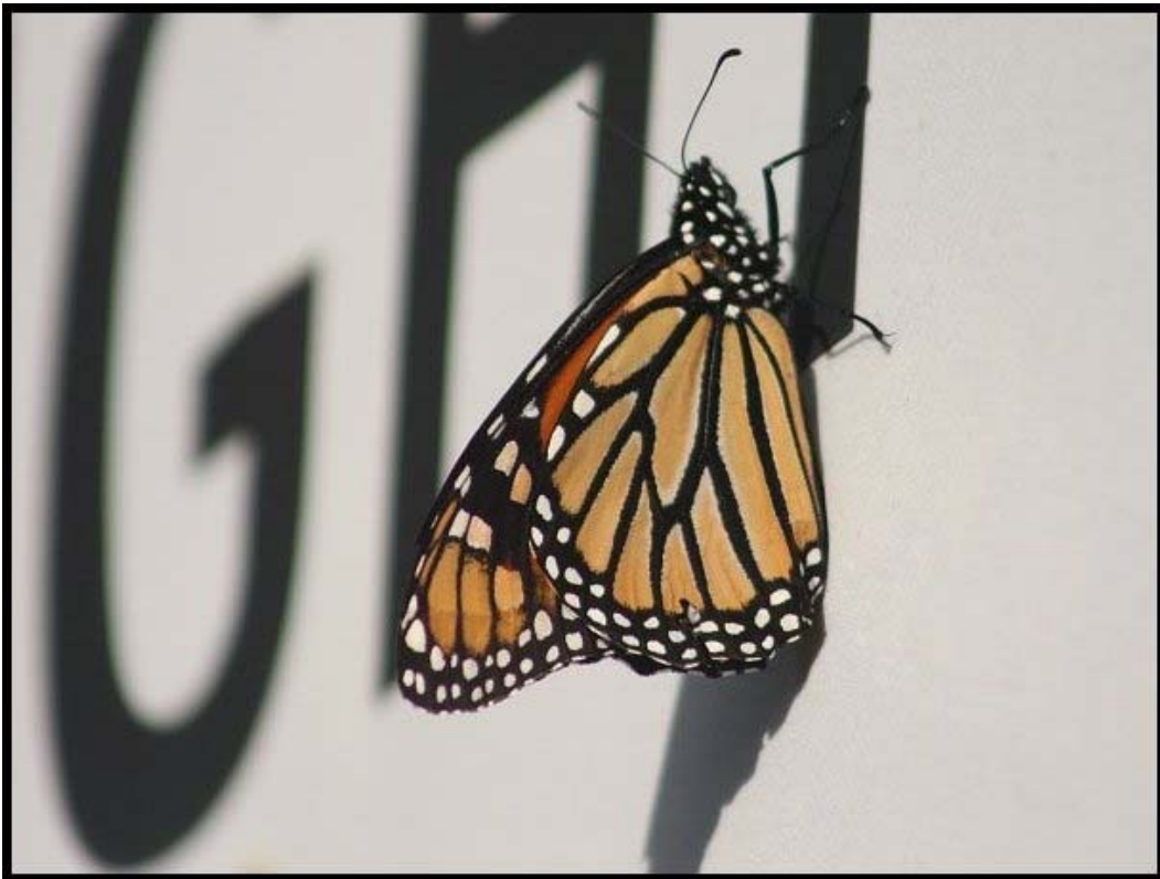
Migrating Monarch butterfly