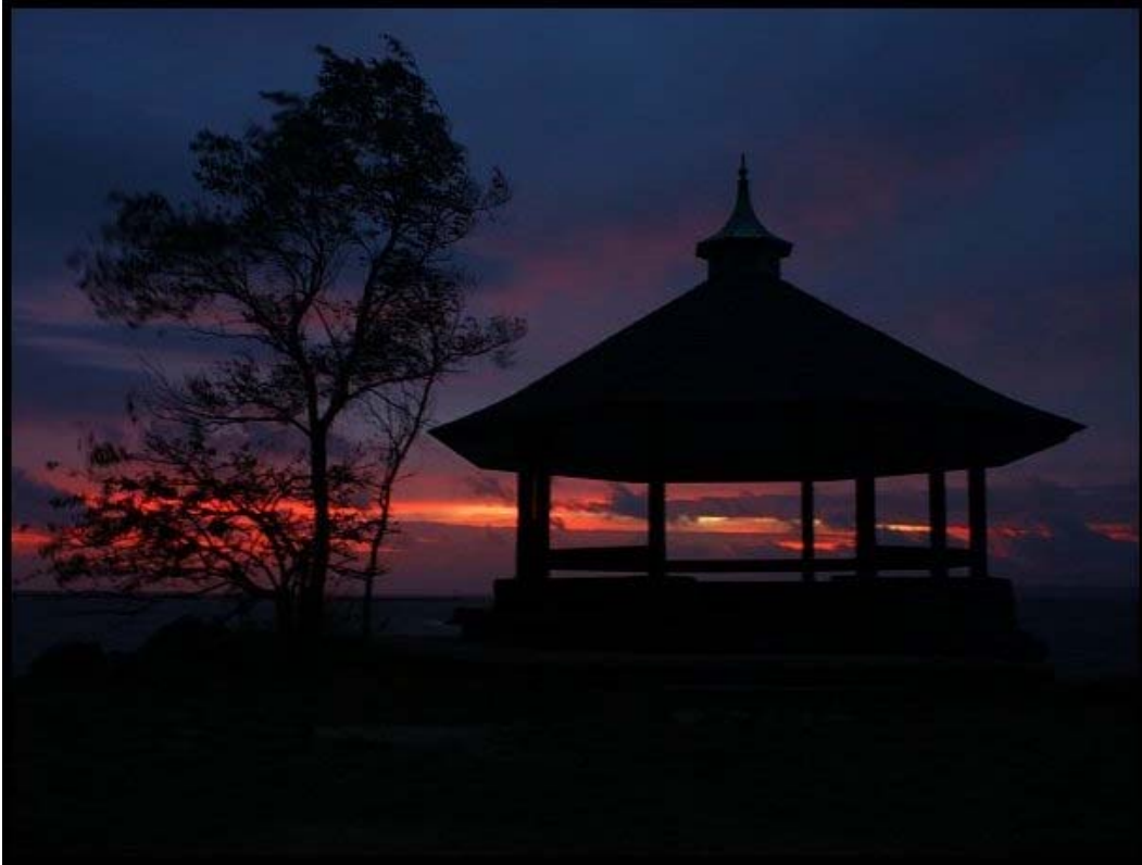
Clouds briefly break ahead of an advancing storm just before sunrise