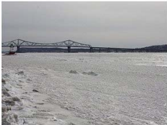
Ice-filled Hudson River

With the deep and persistent cold, streams, rivers, waterfalls, and even the Long Island Sound have been icing up. In recent days, the Long Island Sound has become seeming a mass of more ice than water.