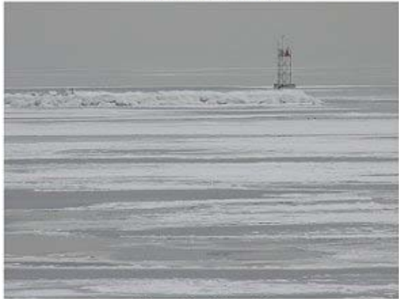
Long Island Sound