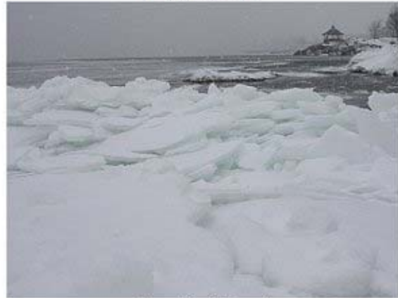
Long Island Sound

Despite the sting of Jack Frost's icy breath this February, winter is filled with hidden beauty for all those who seek it. One example of late is a magnificent sunrise over ice that would have satisfied a range of artistic tastes.